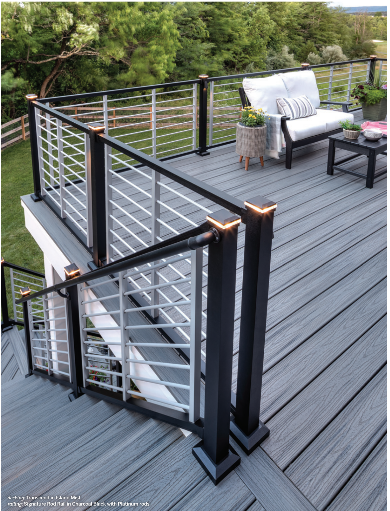
decking: Transcend in Island Mist railing: Signature Rod Rail in Charcoal Black with Platinum rods