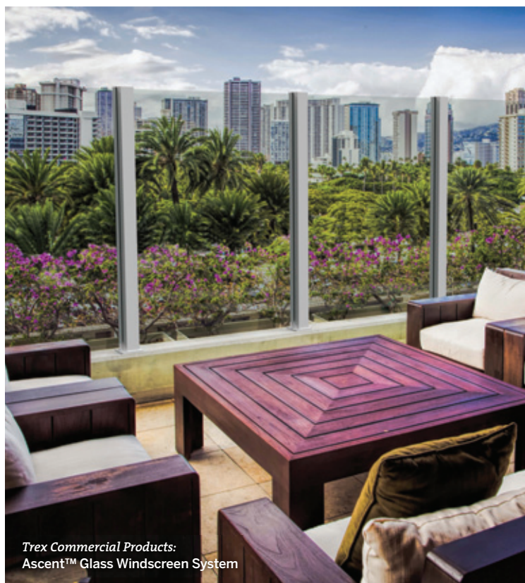
Trex Commercial Products: Ascent™ Glass Windscreen System