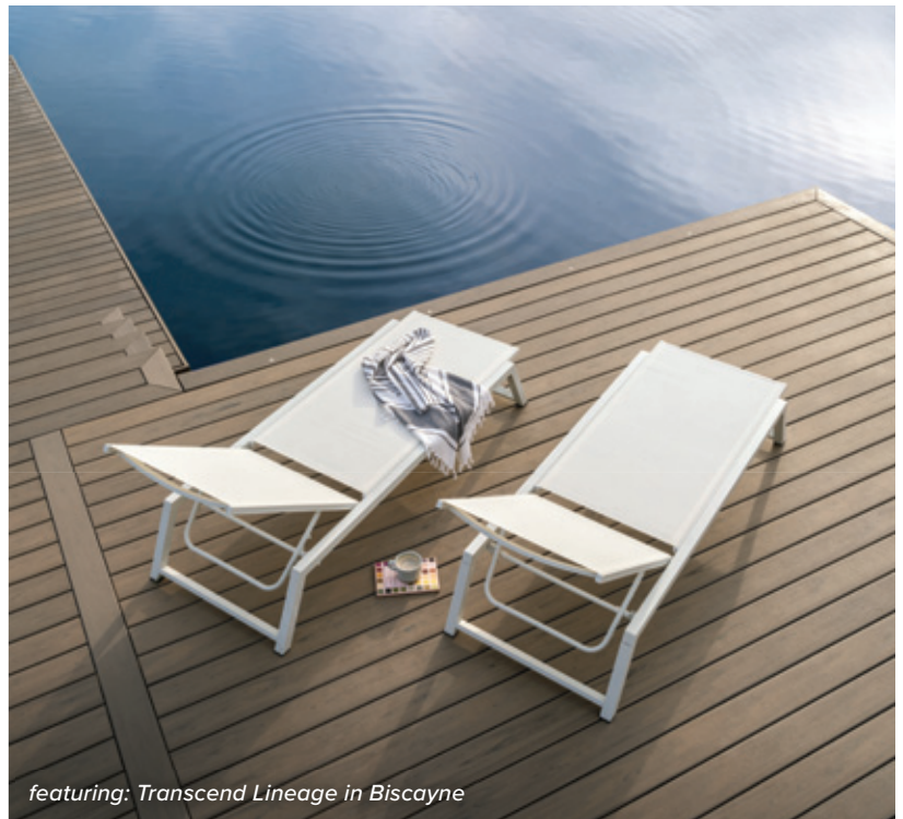
featuring: Transcend Lineage in Biscayne