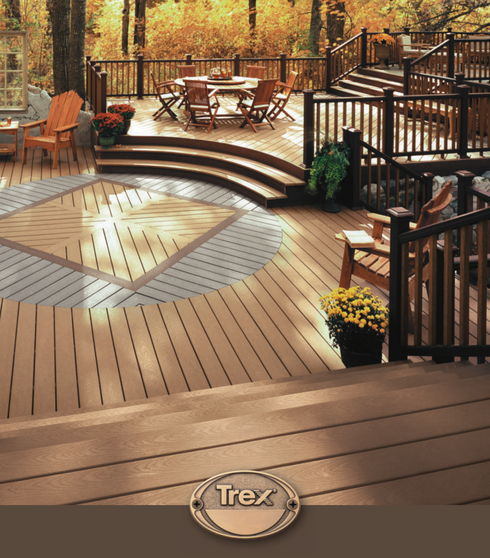
TREX COMPANY, INC. 2006 ANNUAL REPORT